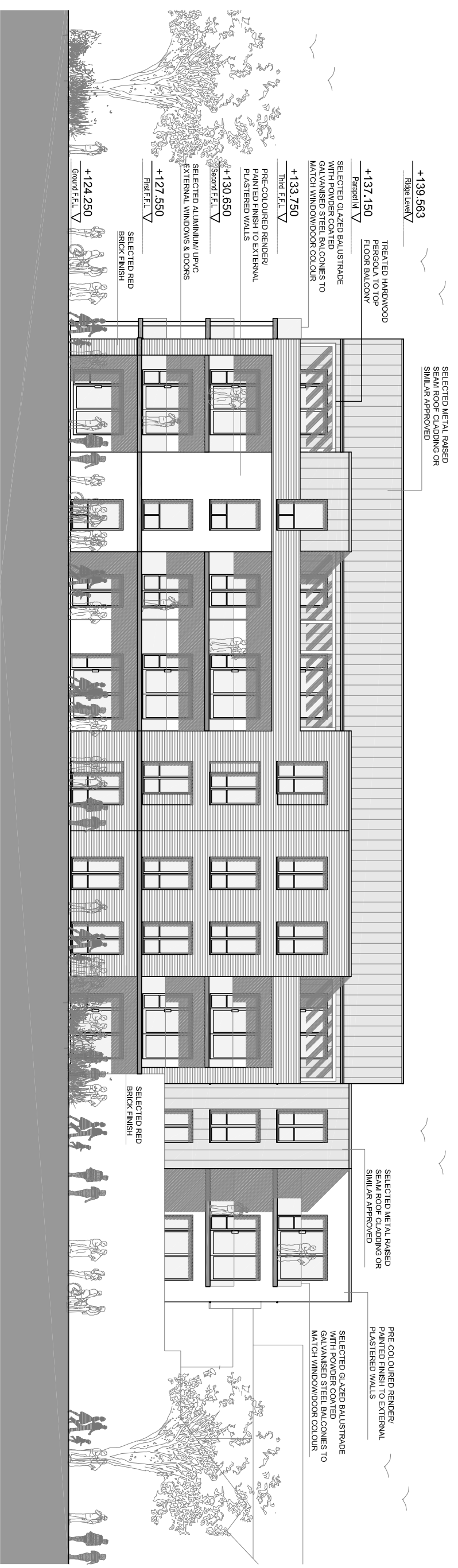
Rear / South-West Elevation SCALE 1:200 @ A3